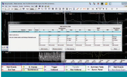
Electrodiagnostics with Scoring Tool