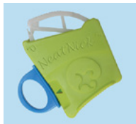
Premie lime For babies weighing less than 1,800 - 2,000 gm (4-5 lb)