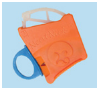
Full-term mango For babies weighing more than 1,800 - 2,000 gm (4-5 lb)