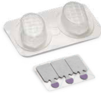
Flexicoupler® and JellyTab®