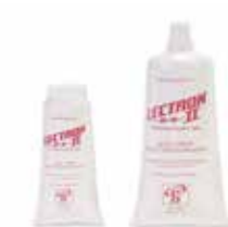
Part #: 109323 Part #: 109328