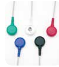
Part #: 301601