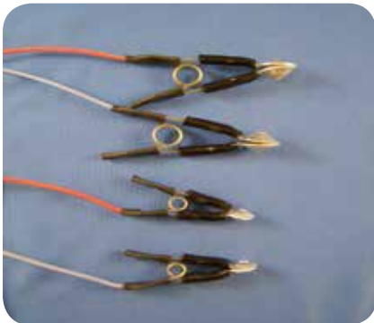
Part #: 101203 - 101204