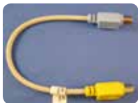
Part #: 541-TSTCBL