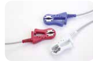
Part #: 301633 - 301666