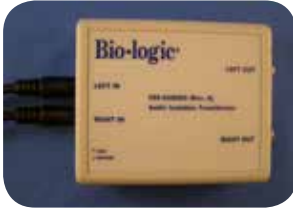
Part #: 580-AUDISO