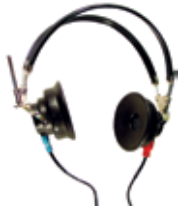
Part #: EP-HEADPHONE