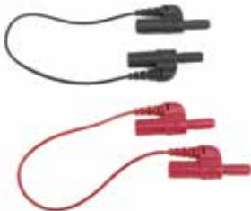
Part #: 301003 - 301004