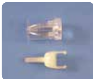
Part #: 203000 & 580-PRBNZL