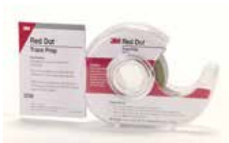
Part #: 109083