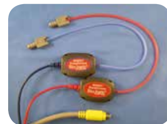
Part #: 580-SINABR-008