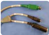
Part #: 541-NAVC04