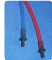
Part #: 202250