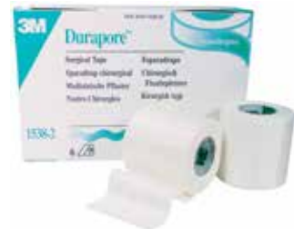
Part #: 109405