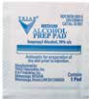
Part #: 109020