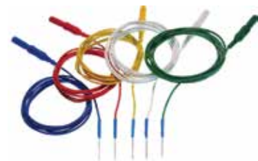
Part #: 102516