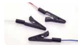
Part #: 301633 - 301635