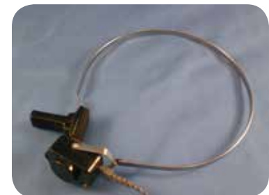
Part #: BONE-OSC

NOTE: For use with Bio-logic Navigator Pro AEP and MASTER II systems.