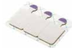
Part #: 101661