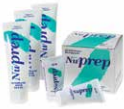
Part #: 102566N