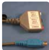
Part #: 541-NAVC10