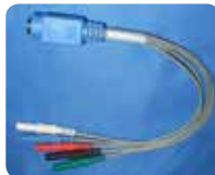
Part #: 001077