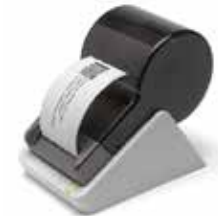
Part #: 580-AX-PRINTER