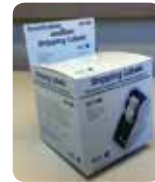
Part #: 501881