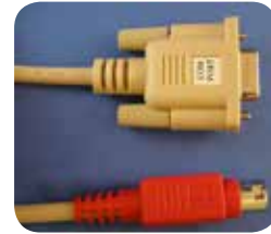
Part #: 541-NAVC01