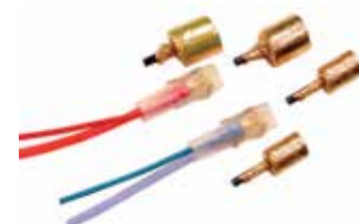
Part #: 101111, 101113, 301116