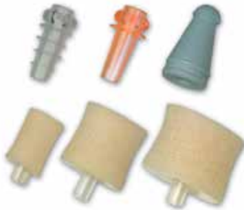
Part #: 203200 - 203219

Bio-logic® disposable OAE probe tips can be used for OAE testing with Bio-logic AuDX®, AuDX® Pro, Scout® and ABAer® systems. They can also be used for ABR testing with the 580-SINSER-012 insert earphones using the infant tip adapter (#202240). OAE probe tips come in a variety of sizes from preemie to adult to fit most ears and are conveniently packaged in 20/bag or 100/bag. Not made with natural rubber latex. Single patient use only.