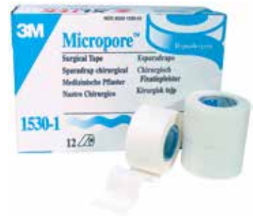
Part #: 109401