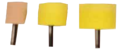
Part #: 202121 - 202123

NOTE: Compatible with 580-SINABR-008 and 580-SINSER-012 Insert Earphones. Used with Bio-logic ABAer and MASTER II systems.