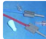
Part #: 202240*