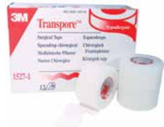
Part #: 109403