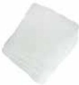
Part #: 109040