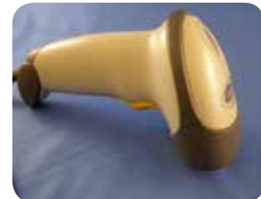
Part #: 040947