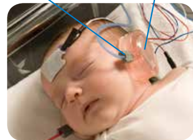
Part #: 206202