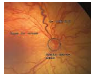
Image annotation allows addition of notes, circles and lines on captured images for future reference

“The introduction and widespread adoption of the digital RetCam technology for pediatric ocular imaging has allowed for objective determination of disease state and progression while permitting immediate collaborative consultation amongst quaternary specialists, raising the standards of the entire field.”