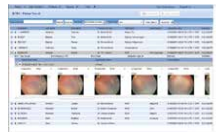
Convenient viewing of key patient information is available at-a-glance including image thumbnails