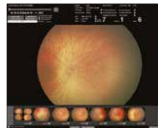
Brilliant full screen images can be viewed along with thumbnails that are captured during an exam