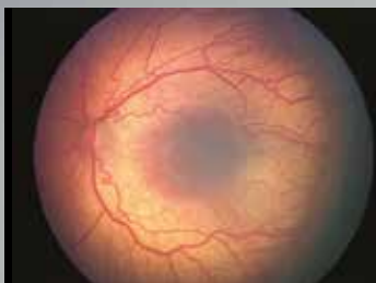
Image of ROP