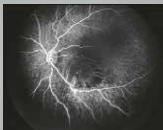
Image of ROP with FA