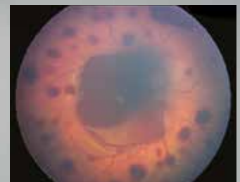
Image of Non-accidental Head Trauma