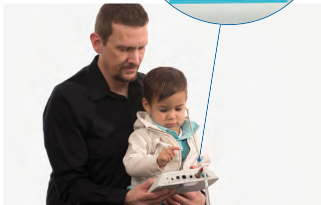
The optional OAE module includes a single-touch “child mode” feature with an engaging cartoon—making it easier for the child to remain calm while testing.