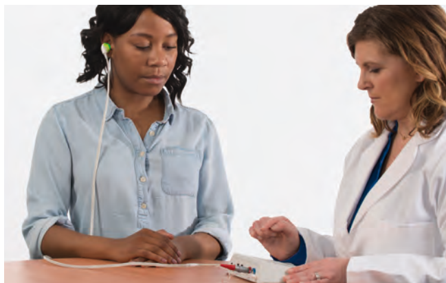
Light on probes provide a visual probe status during testing.