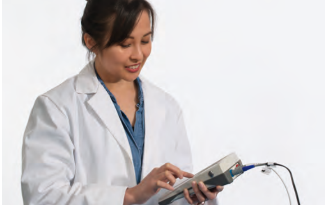
The next generation Bio-logic NavPRO ONE offers easy, battery-operated, handheld testing allowing you to take the test to the patient.