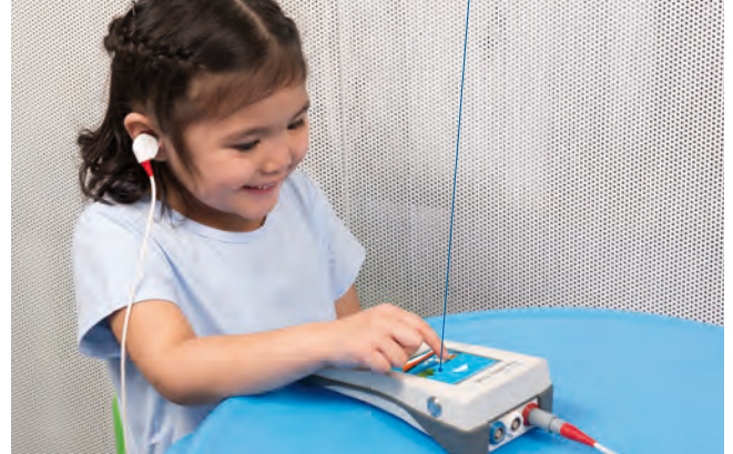
The optional OAE module includes a single-touch "child mode" feature with an engaging cartoon—making it easier for the child to remain calm while testing.