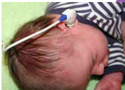
Correct probe placement.

It is important that the probe tip points in the direction of the tympanic membrane and not towards the ear canal wall (see illustration below).