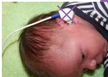
Wrong probe placement.

It is important that the probe tip points in the direction of the tympanic membrane and not towards the ear canal wall (see illustration below).