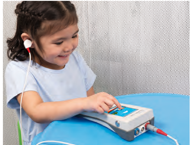
Convenient, single-touch “child mode” feature for optional OAE testing makes it easier for the child to remain calm while testing.