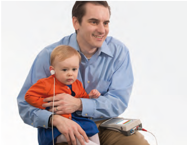
Battery-operated and portable, Bio-logic AuDX allows a hearing screening setup that is comfortable for both the screener and the patient.