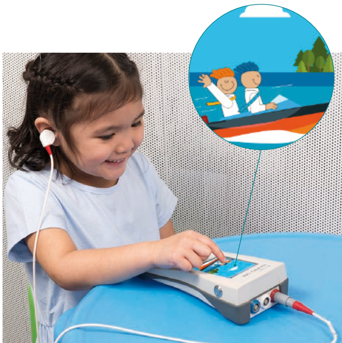
Convenient, single-touch "child mode" feature for optional OAE testing starts an entertaining animation to keep the child engaged and quiet during the test.