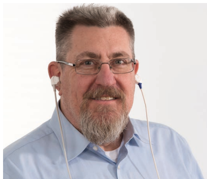
Optional second probe allows for simultaneous bilateral OAE testing.