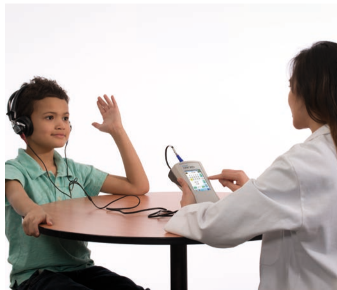
Refined audiometry features include Pure Tone audiometry to 16 kHz as well as Bone Conduction and speech audiometry (live voice and recorded).