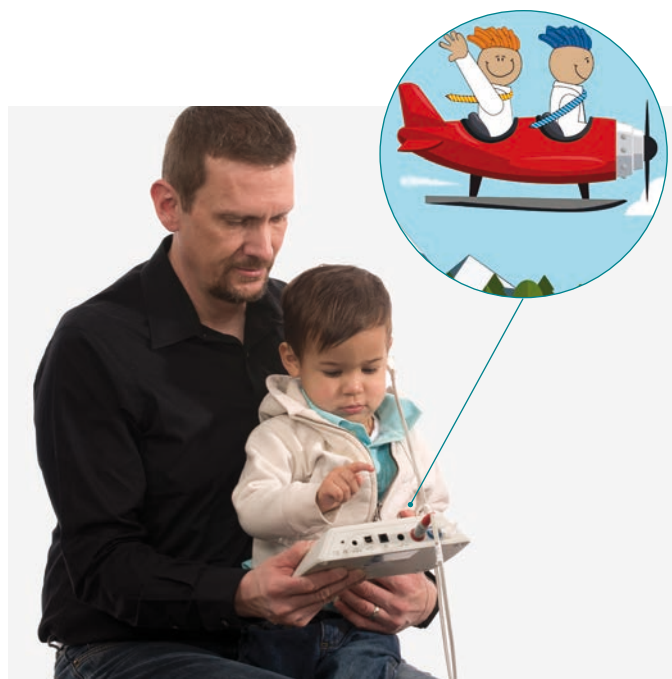
The optional OAE module includes a single-touch “child mode” feature with an engaging cartoon—making it easier for the child to remain calm while testing.