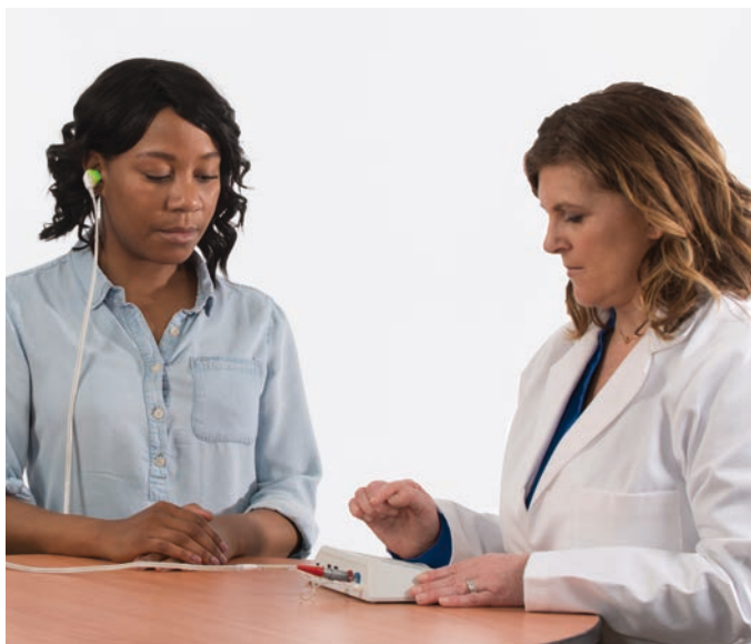
Light on probes provide a visual probe status during testing.